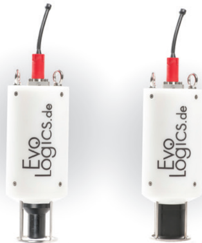
S2CR 48/78 WiSE